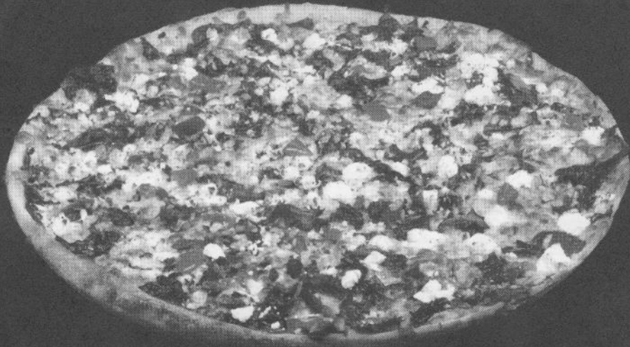
L'ITALIANA, MAMMA'S AWARD-WINNING "OTHER SIGNATURE" FRESH SPINACH